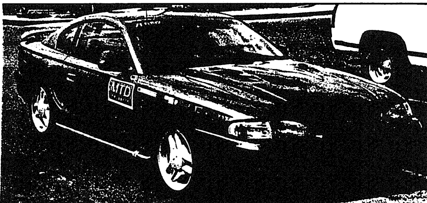
The hood scoop detail on this Cobra-skinned prototype caught testing near Phoenix is similar to 4.6-liter powered Mustangs in Ford's experimental corral. Output for the dohc four-valve destined for the '96 Cobra is expected to be around 300 hp

Beyond the Camaro/Firebird, Mustang resurgence