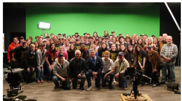
(in photo at filming wrap, 4/20/2022: “Never Give Up” cast and crew)

https://www.facebook.com/LibertyUCinema/posts/4986074228173834