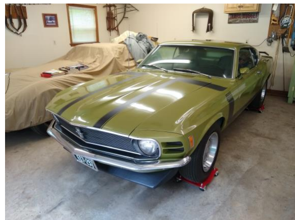
FOS SALE: 1970 Boss 302. (Estate sale.)

(if we are running something that has been sold, please let me know)