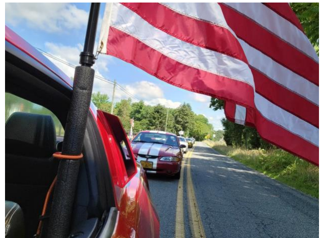
A great picture from the Beaverdam parade – courtesy of Chris Evans.