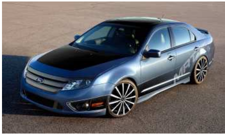
Fusion: A hit from the start

The Fusion lineup expanded in the 2010 model year to include all-new Hybrid and Sport models and a new selection of gas-powered engines – all paired with six-speed transmissions – that deliver even more horsepower and better fuel economy.